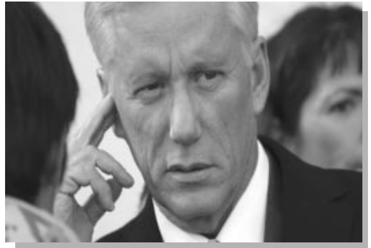
End Game Nu Image