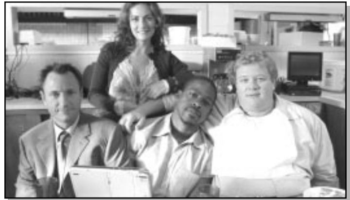
Starve 20TH CENTURY FOX

Extenda, the Trade Promotion Agency of Andalusia, Spain, is a company set up by the regional Government of Andalusia to foster the internationalisation of the region's businesses and economy. It has a main office in Seville and branches in fifteen countries. With the agency's help, the region's audio-visual industry has developed considerably, and now has a competitive edge in the international arena.