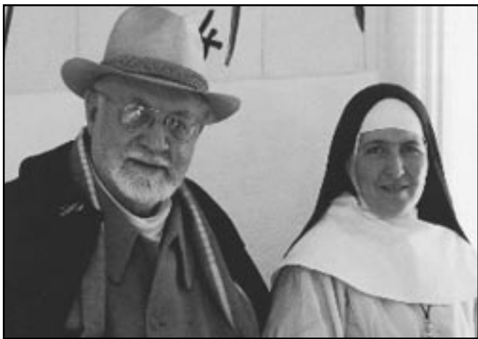
Henri Matisse & Dominican nun

Blockbuskers (2x52') features some of the most breathtaking performances caught on film during the European street festivals. Driving to the heart of these street performances are exclusive behind-the-scenes interviews, which will help viewers understand the strength, courage and passion that motivate these artists to pursue such a career. iStudio Distribution was launched in 2002. Based in Montreal, iStudio Distribution develops, produces and distributes television programs, especially non-fiction programs and feature films. The company is coming to MIP-TV for the second time and exhibiting on the umbrella booth of Telefilm Canada.