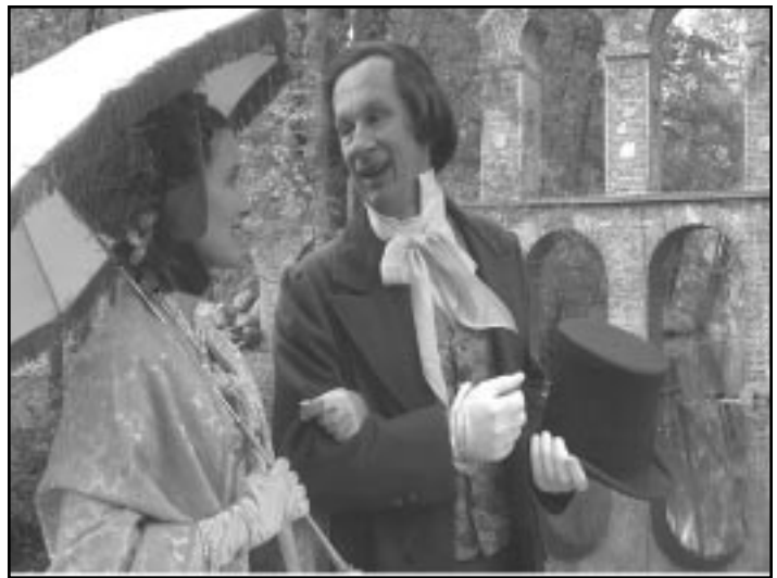
Once Upon A Time – Hans Christian Andersen

3DD has secured the worldwide TV and DVD rights to Once Upon A Time – Hans Christian Andersen, A Celebration which commemorates the 200th anniversary of the classic story. Hosted by Danish broadcaster Danmarks Radio, it was transmitted live in over 15 countries from Copenhagen's Parken stadium, which was transformed into a world of fairytale and fantasy. Performers include Renée Fleming, Jean Michel Jarre, and the Danish Royal Ballet. Broadcasters already secured include SBS (Australia), YLE (Finland), SVT (Sweden), Czech TV, and Icelandic National Broadcasting. The two TV specials (90 minutes and 120 minutes) are directed by David Mallet and produced by Endemol-Initial.