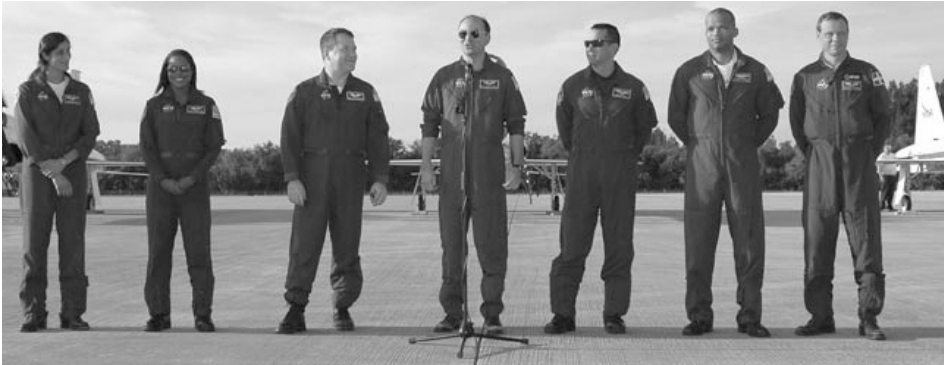
European Space Agency Astronauts

absence of Western underwriting; less expensive experiments were substituted for those in the original plans. The Soyuz TM-12 mission, which included Soviet cosmonauts Anatoly Artsebarsky and Sergei Krikalev, launched on 18 May 1991 and lasted eight days, most of that time spent at the Mir space station. Sharman's tasks included medical and agricultural tests, photographing the British Isles, and participating in an amateur radio hookup with British schoolchildren. She landed aboard Soyuz TM-11 on 26 May 1991, along with Viktor Afanasyev and Musa Manarov. She has not returned to space, although she was one of three British candidates in the 1992 European Space Agency astronaut selection process, and was on the shortlist of 25 applicants in 1998.