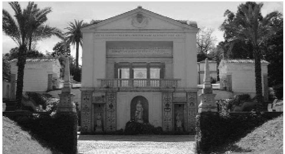
Pontifical Academy of Social Sciences in the Vatican

Suchocka has been serving as Poland's Ambassador to the Holy See since December 2001 and is also a member of the Pontifical Academy of Social Sciences in the Vatican (appointed by Pope John Paul II on 19 January 1994).